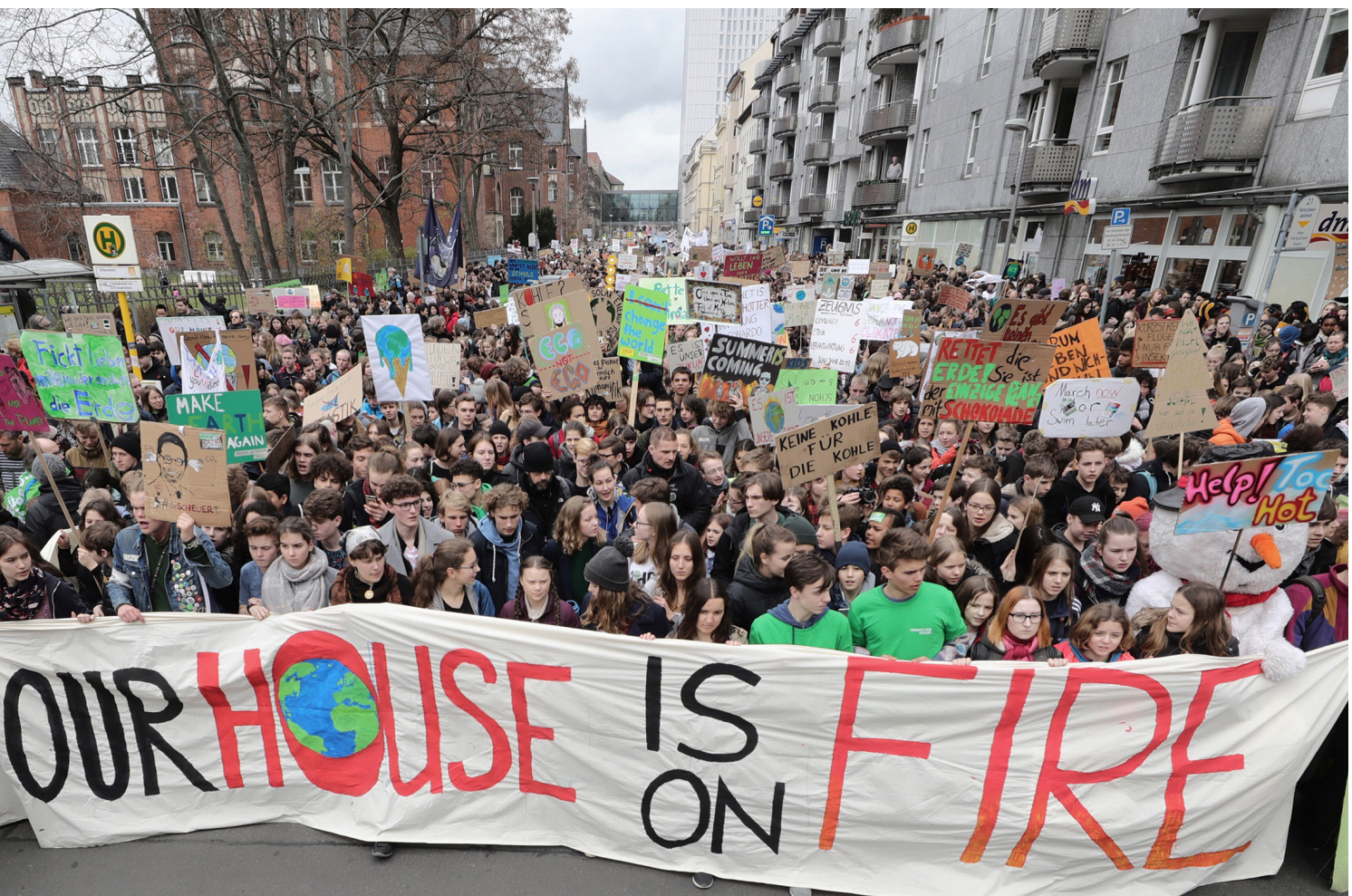
Greta Thunberg leading a climate demonstration in 2019 in Berlin.