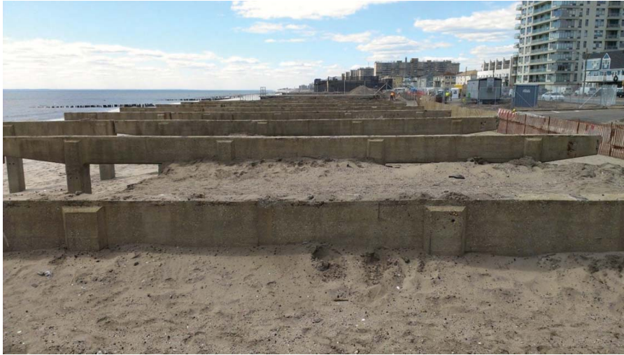
Figure 1. This photo, taken in March 2013, shows remnants of the destroyed Rockaway Peninsula boardwalk and ongoing beach erosion problems. (Color figure available online.)

among multiple actors, including formal disaster response agencies, digital humanitarians, community organizations, and the individual members within these groups. As such, the current project speaks to Barkan and Pulido's (2017) encouragement to understand the ways in which claims—for resources, recognition, or participation, for example—are made, disciplined, and addressed. Barkan and Pulido (2017) touched on the ways in which cartographic knowledge production “crystallizes recognition of injustice—even