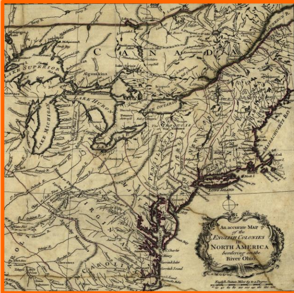
An accurate map of the English colonies in North America bordering on the river Ohio, 1755. http://www.loc.gov/item/74692232